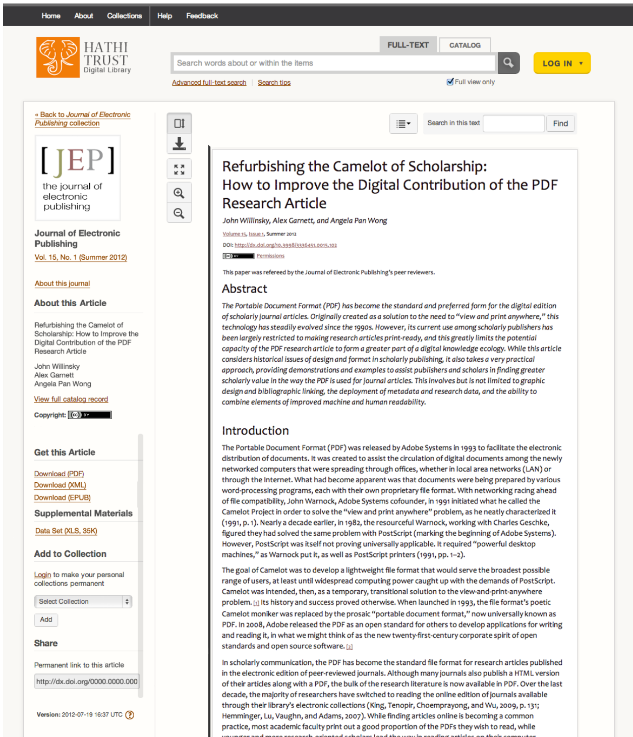
Figure 2: Mockup of an article viewed in HathiTrust's user interface

originally designed to support reformatted print materials. The reading interface in HathiTrust, which previously supported only rendering of digitized page images, renders JATS XML in HTML and allows a user to download a dynamically generated PDF and EPUB, display metadata specific to articles (figure 2), and link to a special "collection" for the journal in HathiTrust's Collections application [17] that allows for browsing volumes and issues of the journal (figure 3).